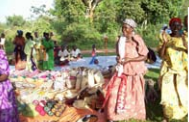
Collection of some the products of the Basketry Cluster, Luwero