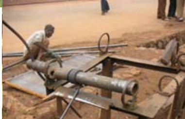
Katwe Metal Fabricators Cluster: An Artisan welding a metal door