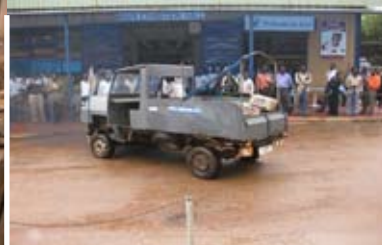
A prototype of the poor man's car by the Katwe Metal Fabricators Cluster