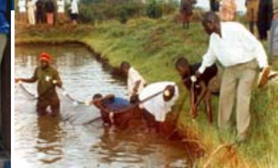
The fish farming cluster, Kaliro