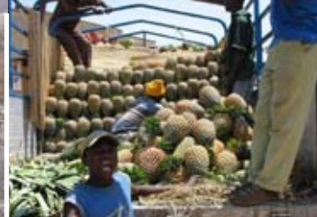
Kayunga Pineapple Cluster: Distribution of Pineapples to markets