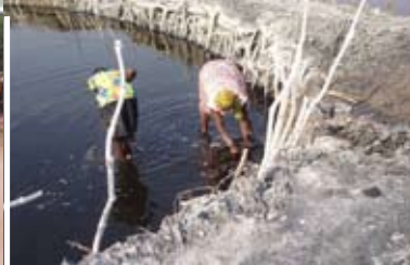
Lake katwe salt processing. Salt miners in Lake Katwe